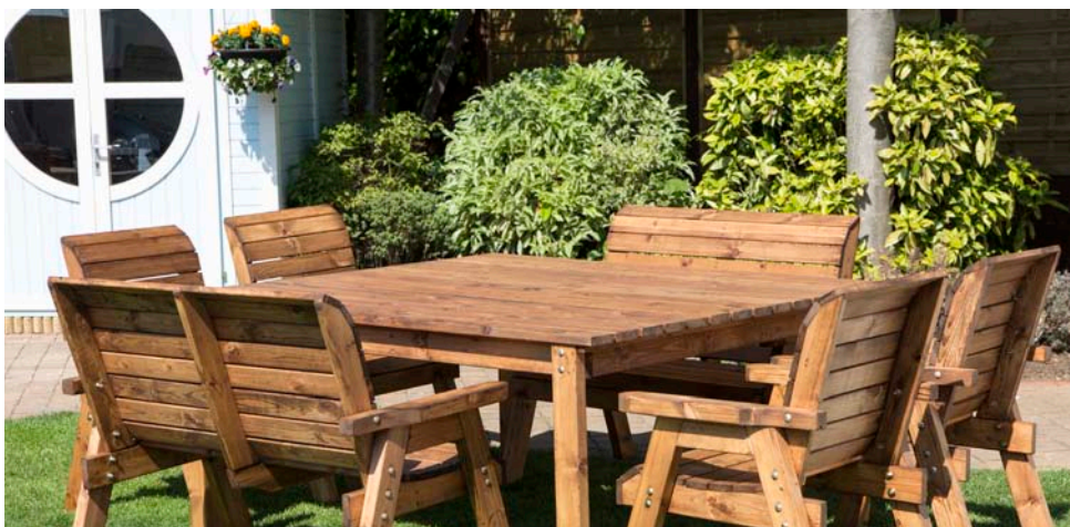
Table L: 2400mm W: 950mm

Eight traditional chairs and one rectangular table with a hole for parasol