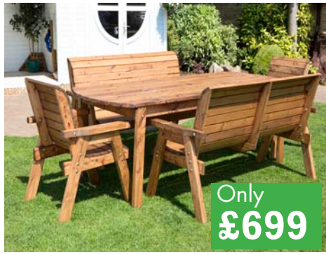
Table L: 1380mm W: 950mm

Two traditional chairs, two 2 seater benches & one rectangular table with a hole for parasol