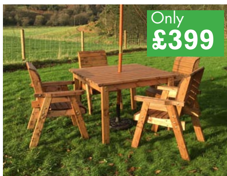
Table L: 1800mm W: 950mm

Six traditional chairs & one rectangular table with a hole for parasol